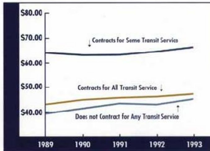
Figure 2: Operating Costs by Type of Transit Agency